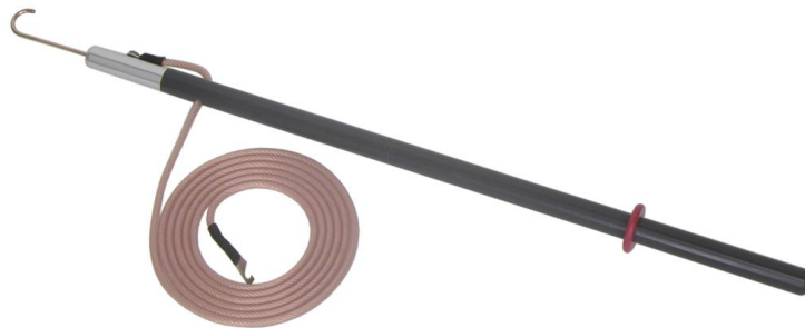
ES30 Earthing stick

Supply lead, spare fuse set, operating manual, earth lead, ES30 earthing stick.