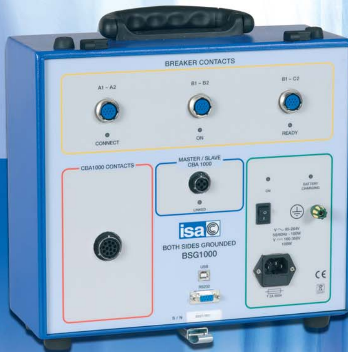
BSG-1000 Main Unit

BSG 1000 is also the best solution for testing those circuit breakers using Graphite Nozzles .