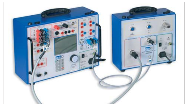
CBA1000 connected to BSG-1000