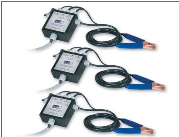
BSG-1000 Remote Heads