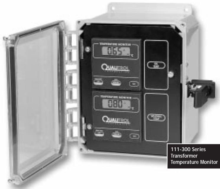
111-300 Series Transformer Temperature Monitor

The 111-300 Series Transformer Temperature Monitor provides more accurate information so you can make better decisions regarding your equipment. Utilizing microprocessor technology and advanced thermal modeling it economically monitors oil and winding temperatures within liquid-cooled transformers. Comprised of one or two independent, single-channel digital monitors housed in a weatherproof enclosure, the 111-300 accurately measures both liquid and winding temperatures using only one liquid well, which makes it extremely easy to install and use.